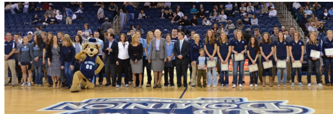
2013 Dean's List

Of the 431 Spring 2013 student-athletes, 28 (6%) student-athletes earned a 4.0 semester GPA, 238 (55%) student-athletes earned a 3.0 or higher semester GPA. (Data is based on the Spring 2013 semester GPAs)